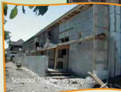
School building in progress