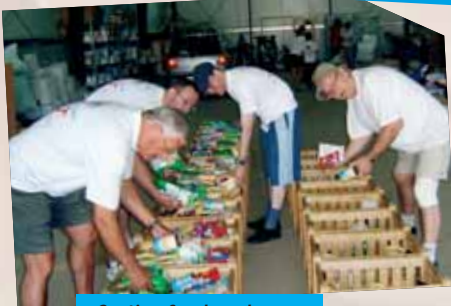
Sorting food packages

One very special trip we have arranged is at Christmas. Yes - actually at Christmas. Arrive Romania December 23rd and stay until December 30th and spend Christmas delivering Food Packages to the poor along with Sacks of Smiles to the children, who without you may not get a present this Christmas. On top of all this, we get to share the real meaning of Christmas, by sharing the Gospel with families who need to know of the