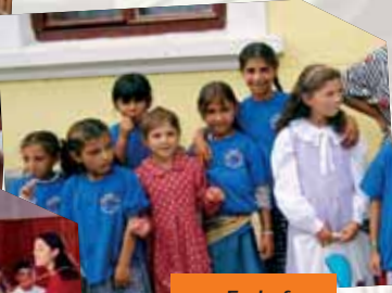
End of year concert