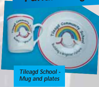
Tileagd School - Mug and plates