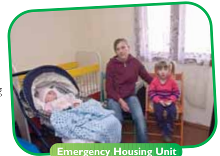
Emergency Housing Unit