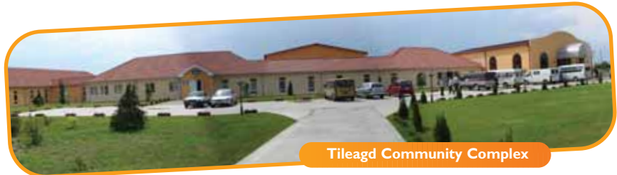
Tileagd Community Complex

A two million dollar investment providing School, Kindergarten, Medical Clinic for GP, Dentist and Optometrist and Church with Pastor and outreach programs year round. The ministry was established in 2001 through meeting the Tileagd (Gara) Gypsy community and still to this day, the Community is at the heart of the work in Tileagd.