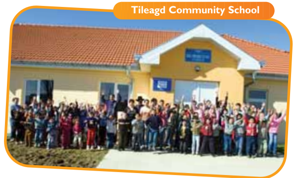
Tileagd Community School