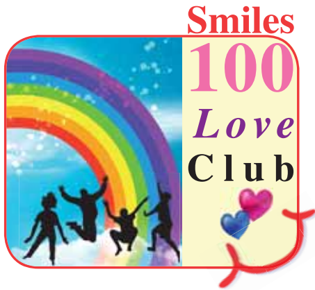
Showing Love to Children living with Family difficulties

Within the new Smiles 100 Love Club, the projects provide for more than 100 children. Details are below of how each project shares God's Love with the children and their families. We'd like to see the number grow if we have enough Love to share around!