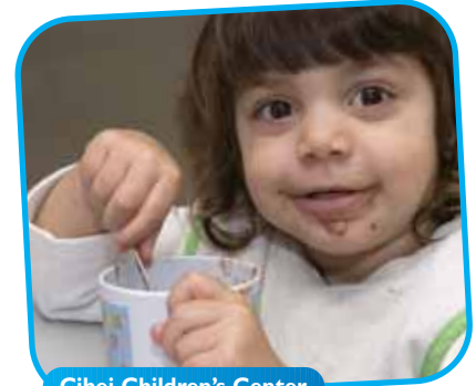
Cihei Children's Center

This project is designed to help families overcome the difficulties that often cause children to be abandoned, neglected or abused. Our experience is that rarely do these situations arise due to a lack of love. So many other problems and pressures are facing parents that sometimes 'situations get out of control'. Smiles is there to help support the family and provide a safe, warm and loving environment for the child, whether short or long term, until solutions are found for the future.