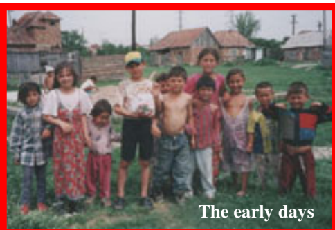
The early days

Back then, I sometimes went to the State school in the Tileagd town, but because I did not know how to read, write or count, I had to repeat the first grade twice. I never managed to get beyond First Grade at the State School, but then I didn't go much anyway.