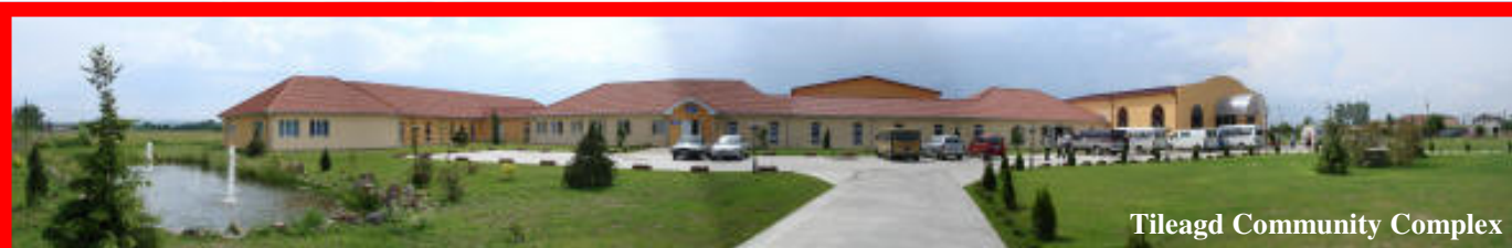
Tileagd Community Complex

Since then, my visits to Oradea became less and less. Once in a year maybe at Christmas because I wanted new shoes or clothes. My village was dirty and ugly, even if our room was ok and clean we were nearly 10 people living in it. I remember one day when my dad came from work he was drunk and he started to hit my mum. We all got scared and we run to our uncle to hide. Once he was asleep we were safe, but this type of experience was happening at least 2 times a week. Everyone in the village, mainly the men, spent their money on drink and the ladies went to Oradea to beg for money and look for food from the waste containers. Life was hard. I was without a dream, no hope, no faith. I did not know what that was!! "