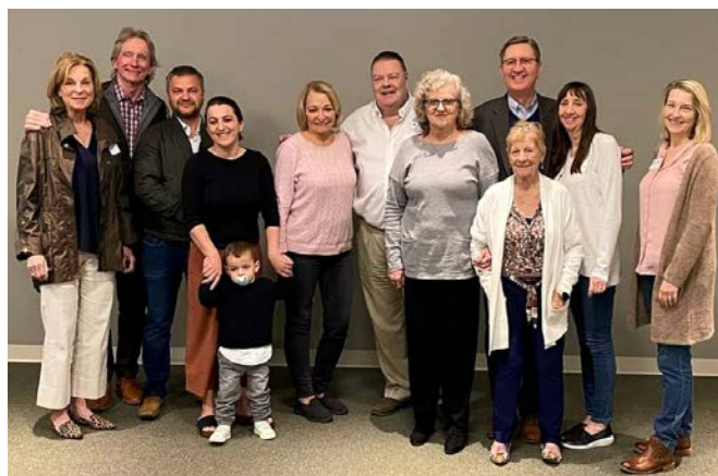
Christ's Church, Jacksonville, Florida

I think that a Mission Trip can change a person and their view about life. It's a great time when you can assess and be thankful for what you have, appreciate life a bit more as my grandmother used to say!